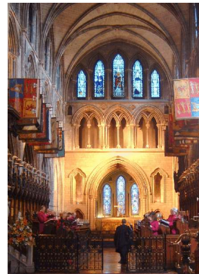
In St. Patrick's Cathedral, Dublin. May 2008

In May 2008, we sang the Offices in St. Patrick's Cathedral, Dublin and in August did the same in Southwell Minster. We visited St. Botolph's church, Allerthorpe near Pocklington for a Harvest celebration in October.