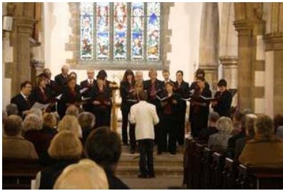
The Heritage Singers in Concert at St. Peter's Church, Thorner, Leeds.

The choir exists to continue the long tradition of choral music which has existed in the Church in England since Tudor times. It has been in existence for thirteen years, being formed initially from church musicians whose local choir was no longer viable. The choir sings mainly for Anglican or Church of England Services but has also sung for services in Churches of other traditions and aims to produce an English choral sound in the music sung.