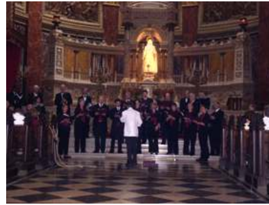
In Budapest May 2007

We sang Evensong in the wonderful St. Nicholaaskerk, Amsterdam in 2006 and in St. Stephen's Basilica and Estergom Cathedral in Budapest during 2007.