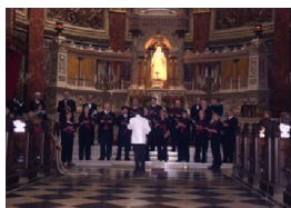
Heritage Singers in Esztergom Cathedral, Budapest.

The choir has performed in concerts, mainly to raise funds to help in the core work of singing for services. There is no charge made to sing a service, although donations are always appreciated towards the cost of maintaining the library of music, robes and other expenses. The concert repertoire, although containing many sacred pieces, adds secular works dating from Tudor times to the present day. What the choir has which is special is fellowship together, co-operation and concern for other choir members. This enables the soloists to not only sing as soloists but also blend in with the other members of the choir to produce the