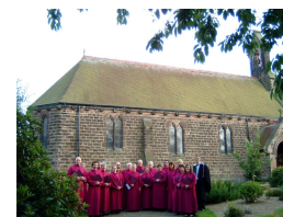
Heritage Singers at Sicklinghall Church

Despite our exciting visits within Europe and the USA, we exist to sing music well and to bring it back to places which have lost it. We are equally happy to work alongside small village choirs in workshops to prepare a service or concert and enable others to still enjoy being part of a live performance.