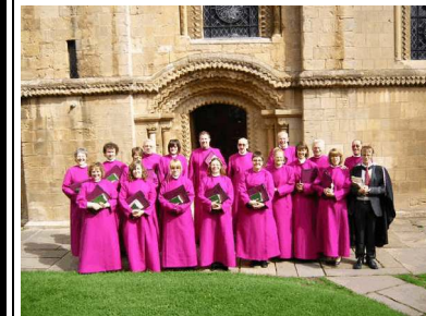
The Heritage Singers at Southwell Minster in 2008

The Heritage Singers is a choir of committed church musicians who travel from many parts of