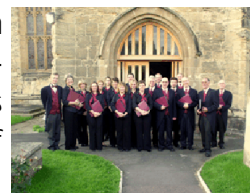
Heritage Singers in Outside Warkworth Church, Northumberland

Despite our exciting visits within Europe and the USA, we exist to sing music well and to bring it back to places which have lost it. We are equally happy to work alongside small village choirs in workshops to prepare a service or concert and enable others to still enjoy being part of a live performance.