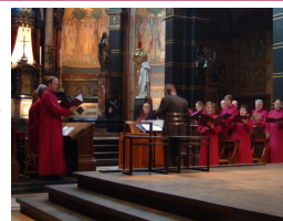
Heritage Singers in St. Nicholaaskerk Amsterdam