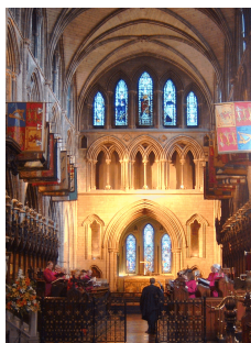
Heritage Singers in Dublin Cathedral

In our seventeen years of existence, we have sung in well over 300 venues, ranging from small village churches to prestigious cathedrals in England, Holland, Norway and America.