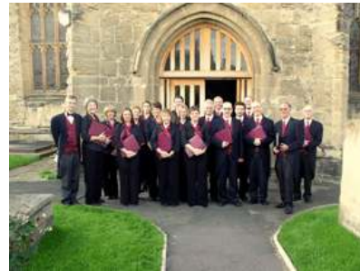
Before a Concert at Warkworth in July 2007

We visited Northumberland in July 2007 and sang the Offices in Hexham Abbey.