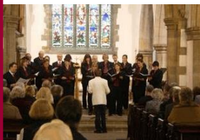
Heritage Singers in St. Peter's Church, Thornor

The choir exists to continue the long tradition of choral music which has existed in the Church in England since Tudor times. It has been in existence for seventeen years, being formed initially from church musicians whose local choir was no longer viable. The choir sings mainly for Anglican or Church of England Services but has also sung for services in Churches of other traditions and aims to produce an English choral sound in the music sung.